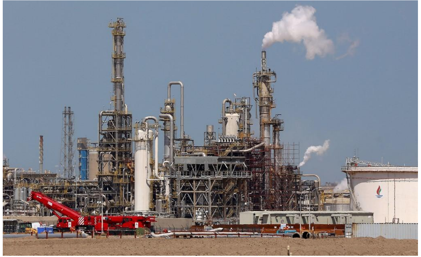
Main category: <u>Middle-East</u>

DUBAI: Kuwait has raised the security alert level at all of its ports, including the oil terminals, the state-run Kuwait News Agency reported on Friday, citing a decision by the trade and industry minister. "The decision emphasizes that all measures have to be taken to protect the vessels and the ports facilities," it said.