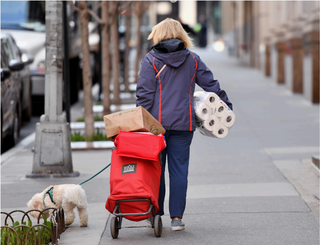
A woman carries groceries and toilet paper in New York City.

“Charmin toilet paper can cost more than $1 a roll, while portable bidets can cost less than $10 and bidet attachments can cost less than $50.