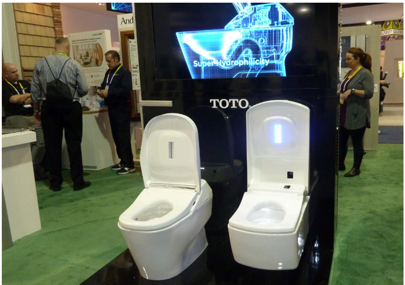
The demo Toto toilet is seen on Jan. 8, 2016 at the Consumer Electronics Show in Las Vegas, Nevada.

The device continued to evolve and morph into different variations, including a mini-shower attachment connected to the toilet.