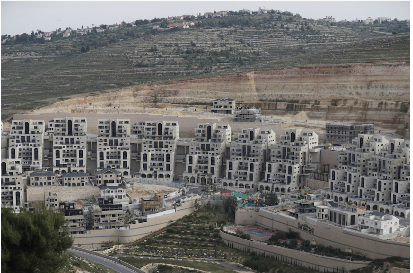
A picture taken on May 13, 2020 shows a partial view of the Jewish settlement of Givat Zeev, near the Israeli-occupied West Bank city of Ramallah.

"What we were trying to do is say [that] if we manage to figure out how to get out of this conflict, you will be able to have all of this massive capital infusion to build up a new state to become something remarkable."