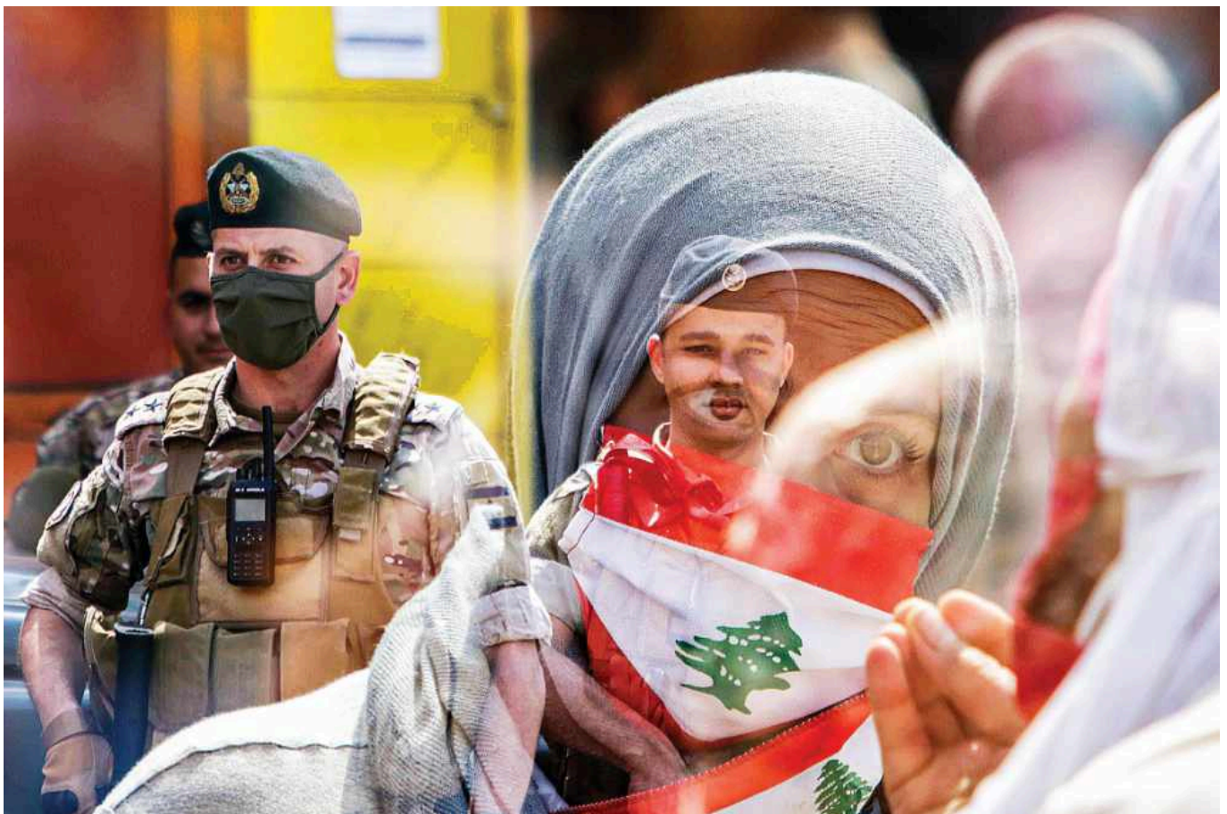
Armed Forces guard a demonstration against the poor economy. Analysts fear poor economic conditions make Lebanon ripe for exploitation.

The economy is projected to shrink by 12 percent this year, while half the government's budget will go to service a debt burden that has reached 170 percent of GDP. The share of Lebanon's population below the poverty line is believed to have jumped to 75 percent from the pre-pandemic level of 50 percent.