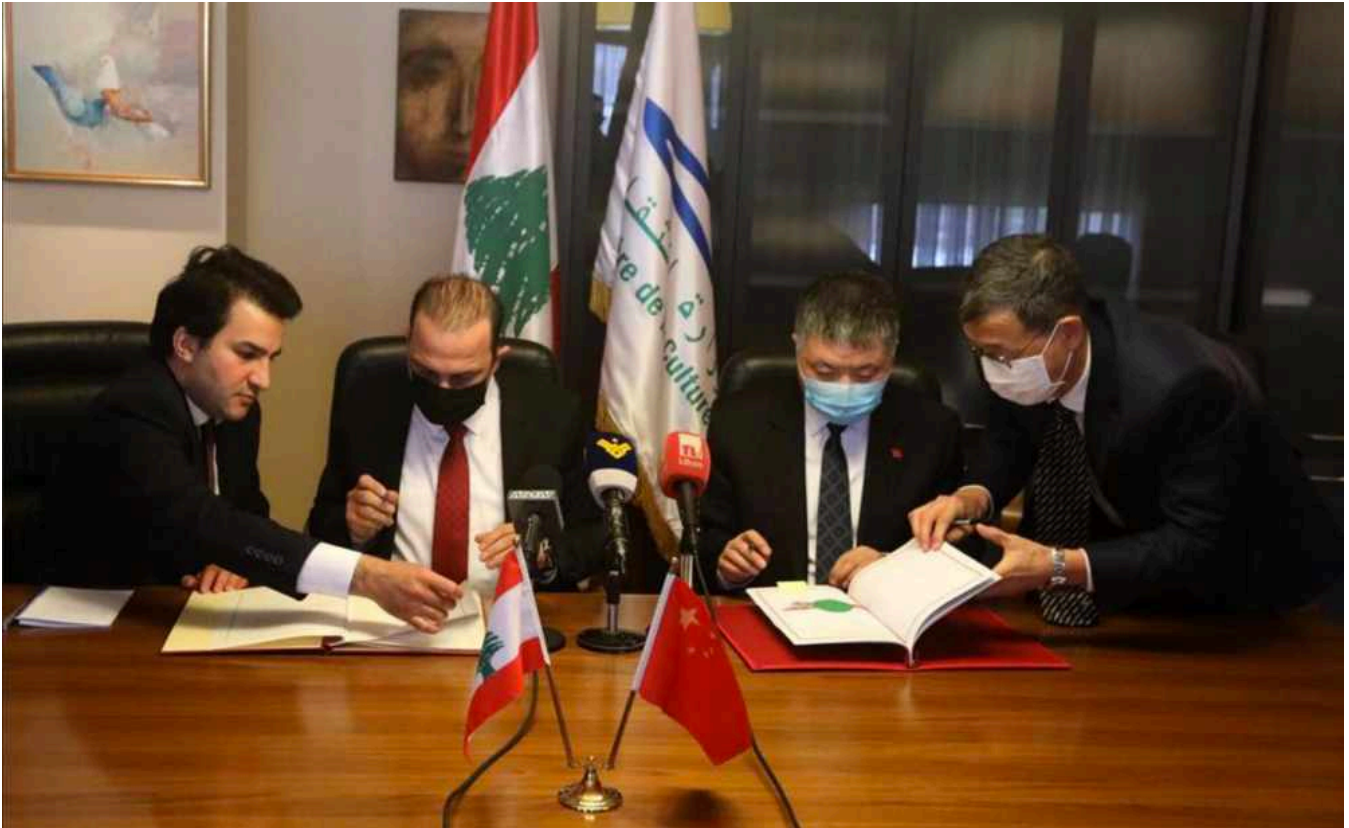
Lebanon's Culture Minister Abbas Mortada (2nd left) and China's Ambassador Wang Wang Kejian (2nd right) signing a cooperation agreement last month in Beirut.

The influence of China can be gauged from social trends as well. In recent years, Lebanon has seen a growing interest among young people in learning Chinese.