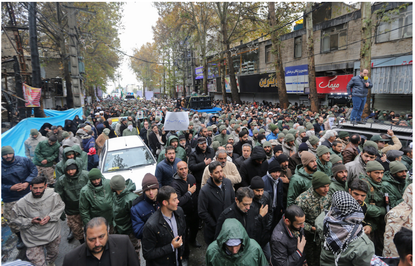
Iranian mourners attend the funeral of Morteza Ebrahimi, a commander of the Islamic Revolutionary Guard Corps, who was killed in violent demonstrations

Up to 30,000 of the NCRI's supporters and members were murdered by the regime in 1988, following a religious edict by hardline revolutionary Ruhollah Khomeini.