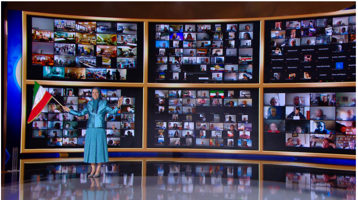
Leader of the People’s Mujahedin of Iran Maryam Rajavi during an event.

These attacks, Ridge argues, are more than illegal and unjust. He believes that Tehran’s relentless assaults on the NCRI betray its fear of the movement’s popular appeal.