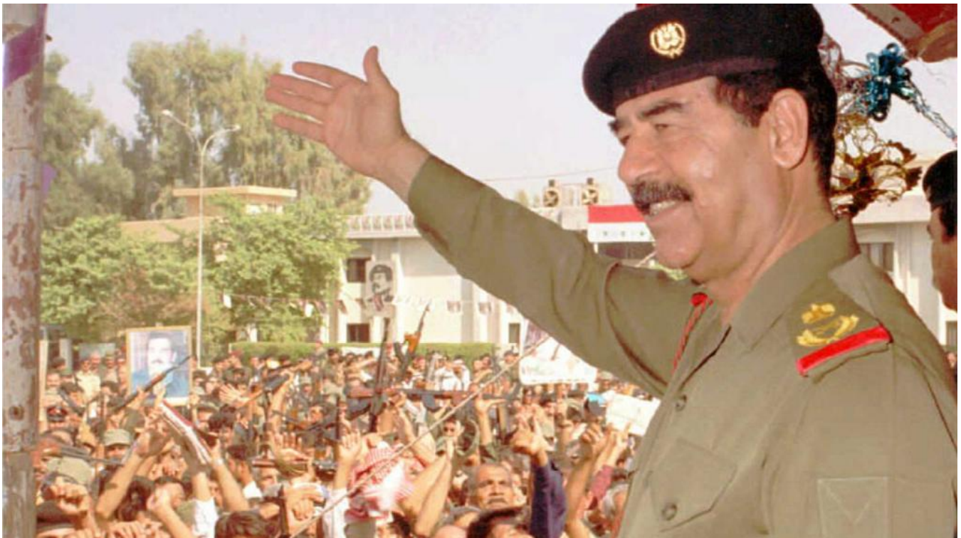
Former Iraqi president Saddam Hussein rallying his troops.

When the hateful regimes of Saddam, Libya’s Muammar Gaddafi, Syria’s Bashar Assad and Yemen’s Ali Abdullah Saleh were challenged and upended, the result was mass civil chaos which has cost upwards of a million lives, displacing countless millions. It may be more than a generation before these nations enjoy the most elementary levels of stability, if ever.