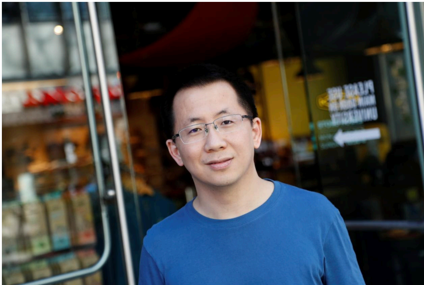
The man behind the app is Chinese billionaire Zhang Yiming.

Known to be extremely private about his personal life, Zhang called Trump's demand to sell the app "unreasonable."