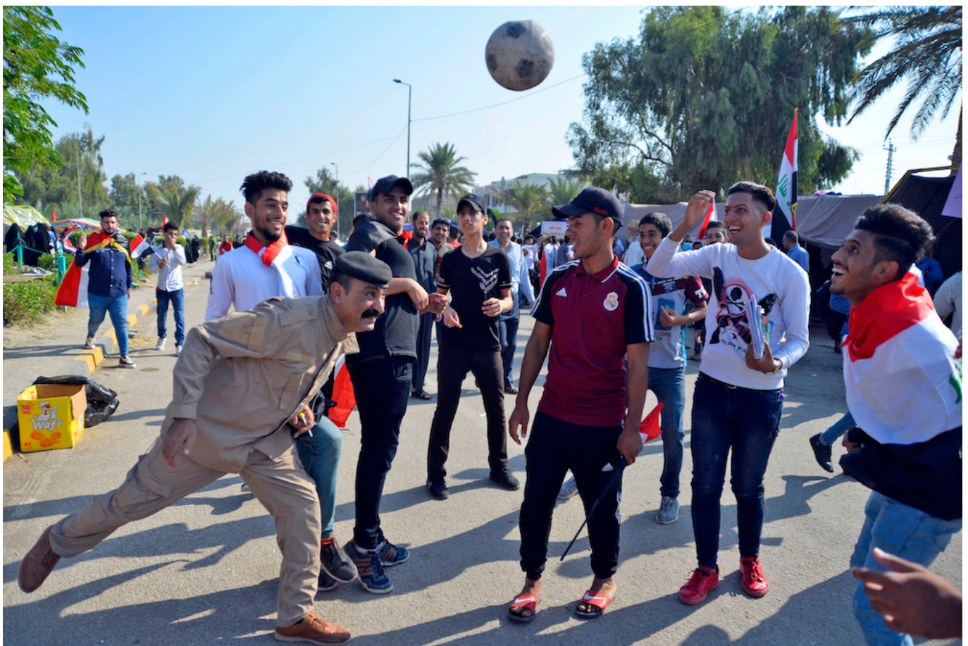
A member of the Iraqi security forces plays football with young protesters

“When you don’t have a ministry of youth, you’re basically excluding all these characteristics and segments of the young population. Our job is to include them all, to understand that each one needs a different kind of strategy.”