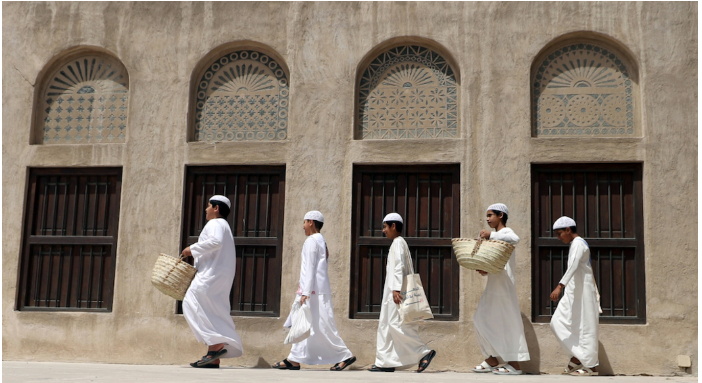
Emirati youths walk in Al Fahidi Neighbourhood, also known as Al Bastakiya, a historic district in Dubai, on April 26, 2018.

“It’s nice to see that all youth around the Arab world are trying to build a world that works, that is based on the values we see.”