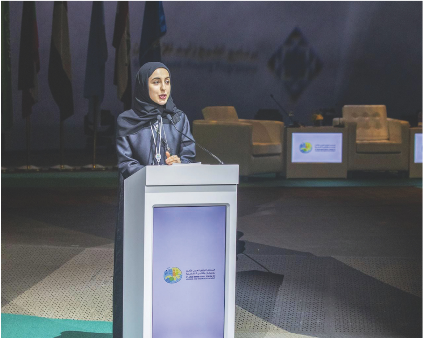
Shamma bint Suhail Faris Al-Mazrui, UAE minister of state for youth affairs.

A pervasive “lack of hope” among today’s youth is due to a combination of regional security and social and economic challenges, according to Al-Mazrui, who was first appointed to the government in 2016 at the age of 22. That said, Arab youth aspirations are not only attainable but can be exceeded – provided governments make available the proper platforms for unlocking their full potential.