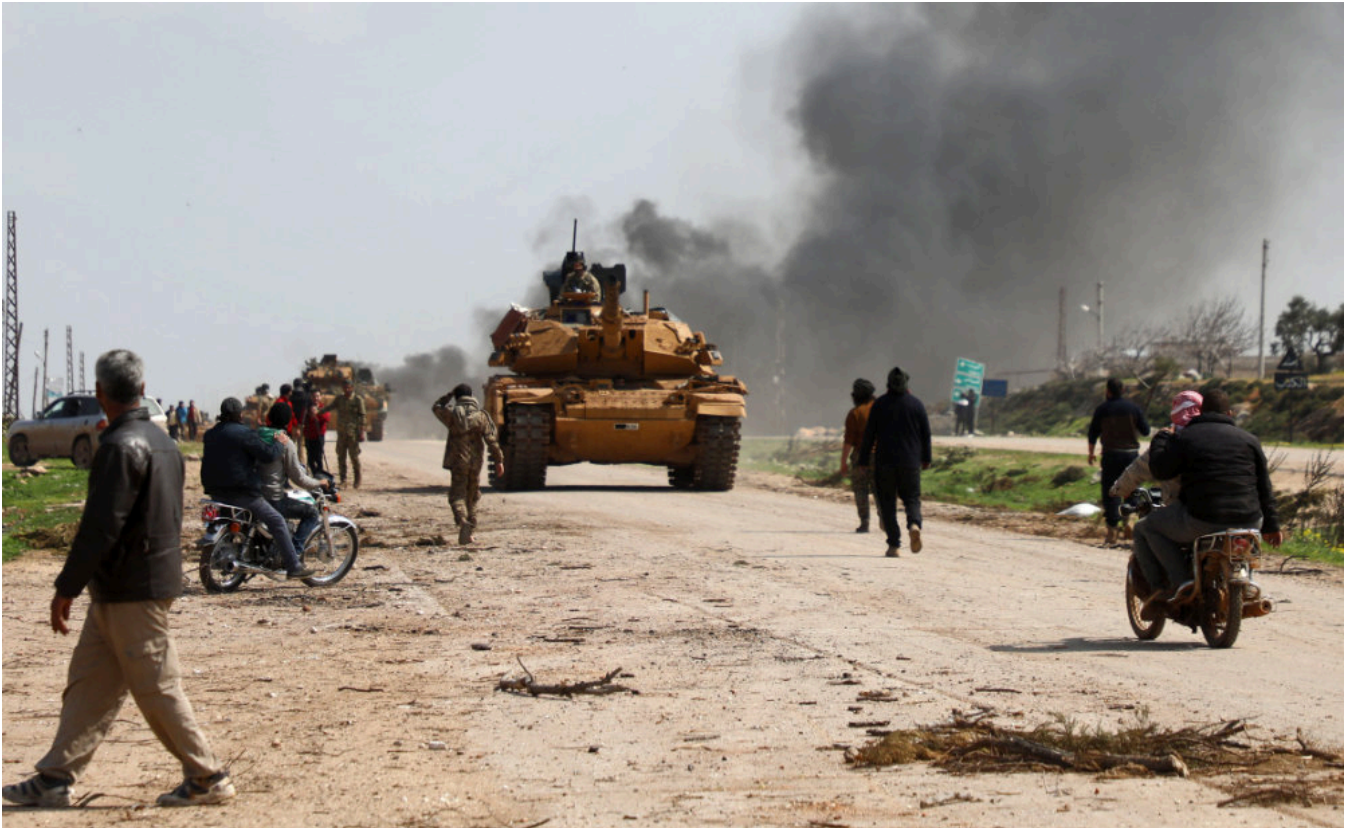
A Turkish military battle tank is seen along the M4 highway, which links the northern Syrian provinces of Aleppo and Latakia, in this March 15, 2020 file photo.