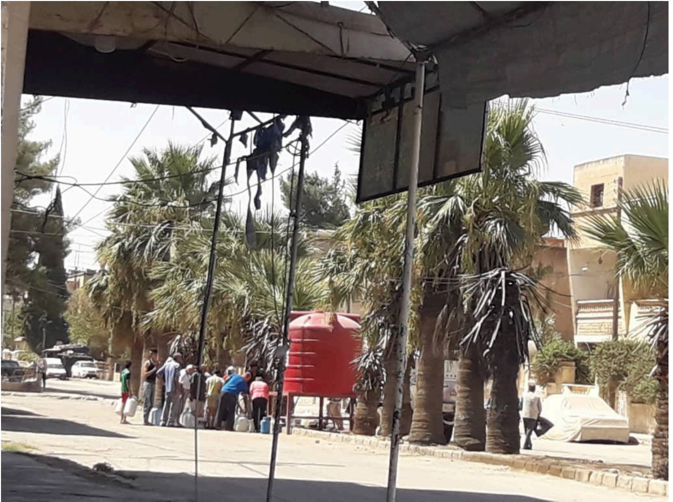
Residents queue for water near the town of Ras Al-Ain in Hasakah, northeastern Syria, after Turkish occupation forces cut off the water supply for their community.

According to the Geneva Conventions and their Additional Protocols, military operations must be conducted in accordance with international humanitarian law and avoid the destruction of objects indispensable to the survival of the civilian population, including water and sanitation.