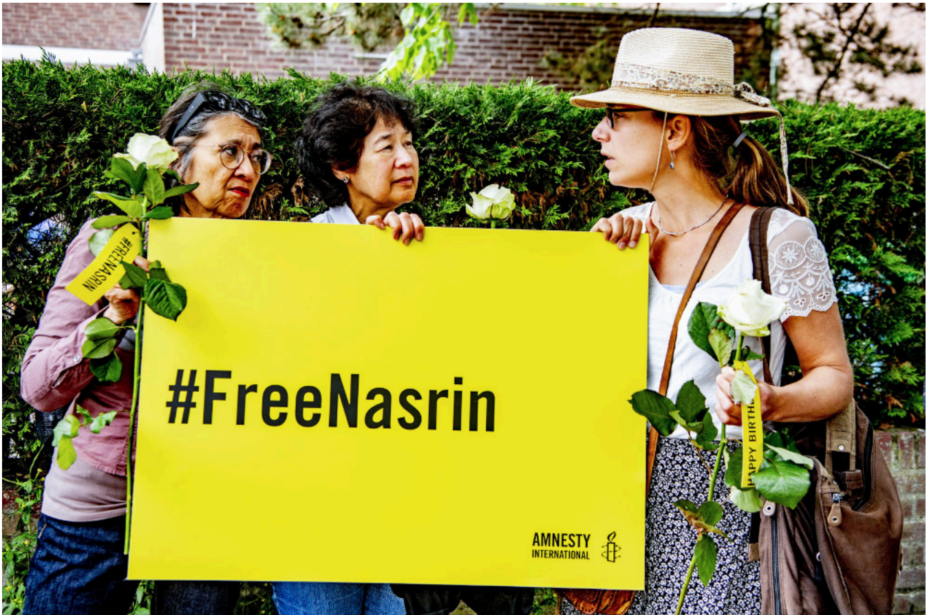
Supporters of Amnesty International campaign for the release of Iranian lawyer Nasrin Sotoudeh by celebrating a birthday party in front of the Iranian embassy in The Hague on May 31, 2019.

Tehran’s treatment of women’s rights campaigners has been particularly harsh. For example, Iran’s Islamic Revolutionary Court sentenced 57-year-old Nasrin Sotoudeh, a leading Iranian human rights lawyer, to 38 years in jail and 148 lashes on charges of “disrupting public order and colluding against the system” for her work defending the rights of women. Amnesty has called the sentence an “outrageous injustice.”