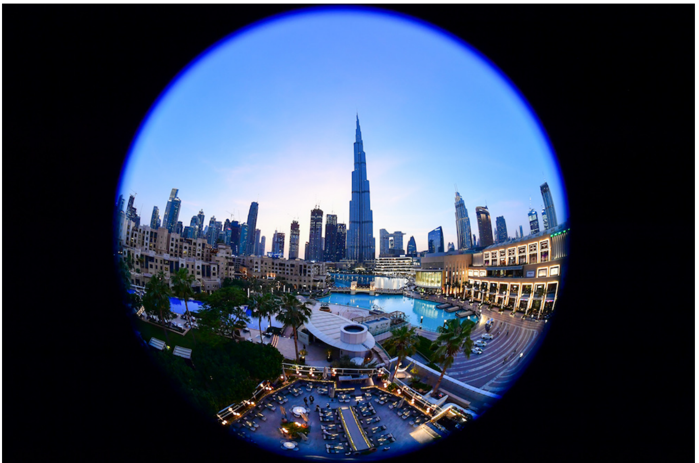
A picture taken with a fish-eye lens on July 19, 2020 shows Dubai’s Burj Khalifa, the tallest structure and building in the world ahead of the launch of the UAE “Hope” Mars probe.

“Thanks to our higher number of customers, we have been able to increase the size of the team, helping a lot of great talent in the market looking for work, as well as expand our food and drink offering.”