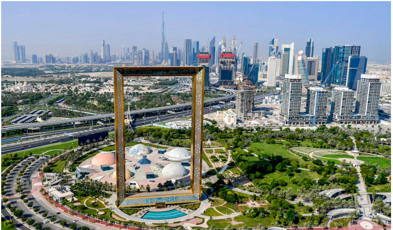
This picture taken on July 8, 2020 shows an aerial view of the Dubai Frame landmark in the Gulf emirate of Dubai.

“This was on top of an already undervalued real estate market,” Taufiq Rahim, an UAE-based senior fellow at the New America Research Institute, told Arab News. “Dubai’s assets were already at a low and it had to adjust to a low base. Now you have an increase in visitors, in people looking for property and for residency.”