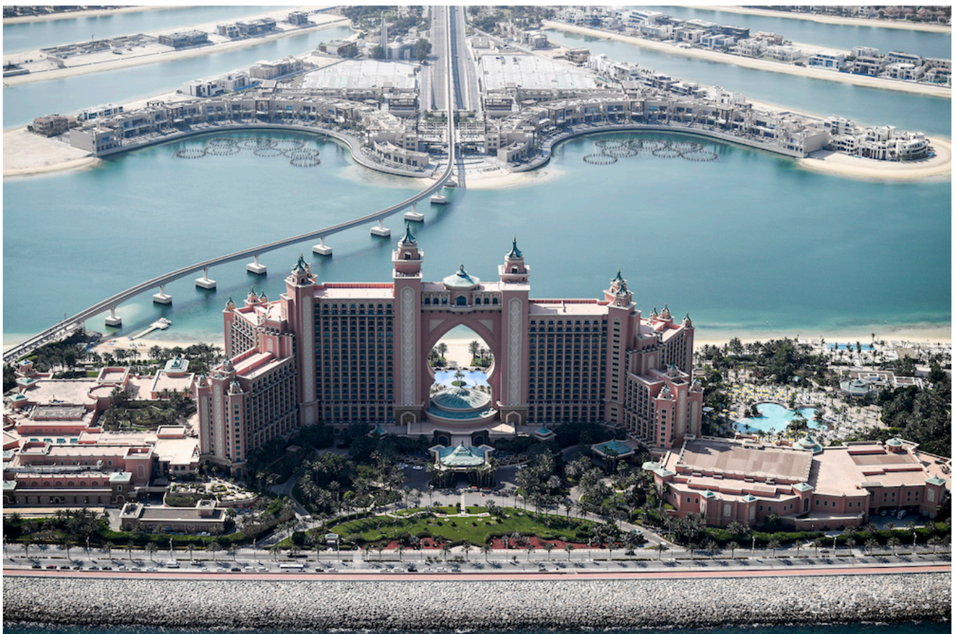
This picture taken on July 8, 2020 shows an aerial view of the Atlantis The Palm, luxury hotel resort located at the apex of the man-made Palm Jumeirah archipelago off the Gulf emirate of Dubai.

Anxiety bubbled away just beneath the surface in Dubai, a cosmopolitan city known for its entrepreneurial energy, boundless ambitions and unlimited shopping opportunities. And after March, two of the emirate's biggest strengths – the aviation and hospitality sectors – proved to be its greatest weaknesses amid a pandemic blamed on a highly transmissible and deadly virus.