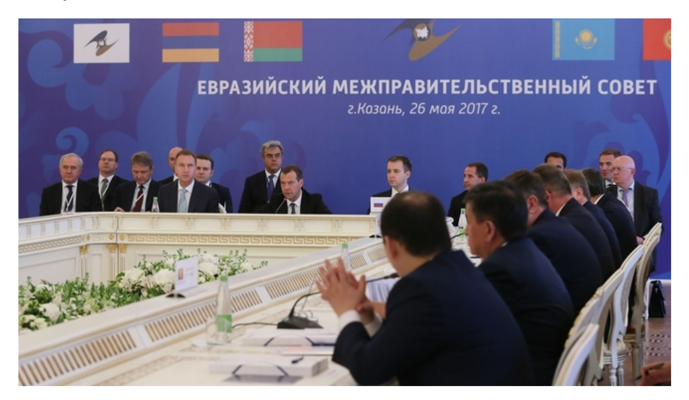
Expanded meeting of the Eurasian Intergovernmental Council