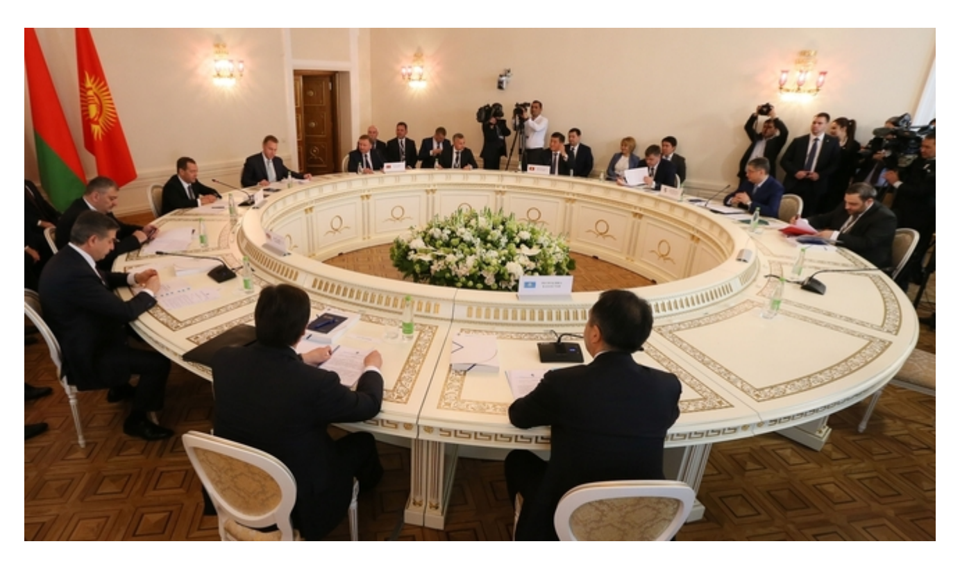
Limited attendance meeting of the Eurasian Intergovernmental Council