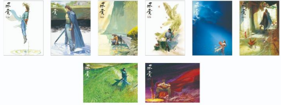
Postage Prepaid Picture Card (Air Mail).