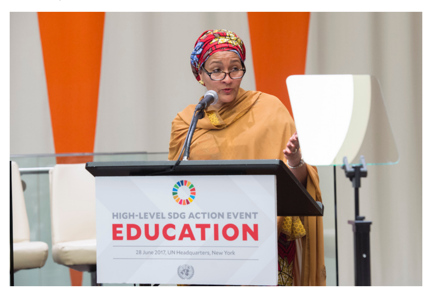
Deputy Secretary-General Amina Mohammed addresses the General Assembly High-

"We know when we deliver education to a young person, we're not only delivering the knowledge and skills they will need to chart their own future — we're preparing them to lend their hands, their mind, and their heart to shaping a more peaceful, prosperous future for their society, and indeed, for the world," she said.