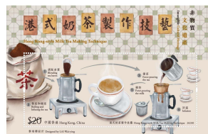
$20 Stamp Sheetlet. 20元郵票小型張。