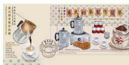
Serviced First Day Cover affixed with a $10 Stamp Sheetlet (date-stamped with associated special postmark). 貼有一張10元郵票小型張的已蓋銷首日封（以相關的特別郵戳蓋銷）。