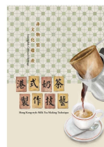
Presentation Pack (Cover). 套摺（封面）。