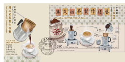
Serviced First Day Cover affixed with a $20 Stamp Sheetlet (date-stamped with associated special postmark). 貼有一張20元郵票小型張的已蓋銷首日封（以相關的特別郵戳蓋銷）。