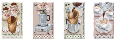
Mint Stamps. 郵票。