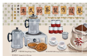
$10 Stamp Sheetlet. 10元郵票小型張。