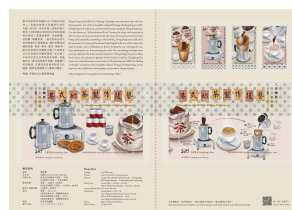
Presentation Pack (Inside). 套摺（內頁）。