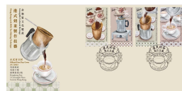
Serviced First Day Cover affixed with a set of mint stamps in four denominations (date-stamped with associated special postmark). 貼有一套四款面值郵票的已蓋銷首日封（以相關的特別郵戳蓋銷）。