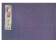
Presentation Pack (Cover)