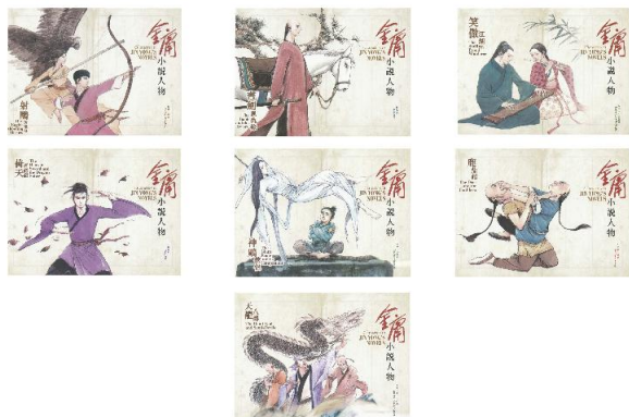
Postage Prepaid Picture Cards