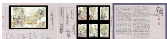
Presentation Pack (Opened)