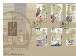
Serviced First Day Cover affixed with a set of 6 stamps and date-stamped with a special postmark.