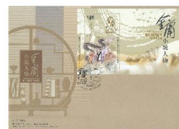
Serviced First Day Cover affixed with a stamp sheetlet and date-stamped with a special postmark.