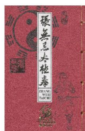
Stamp Booklet (Cover)