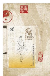
1 of 40 Stamp Sheets in Stamp Booklet