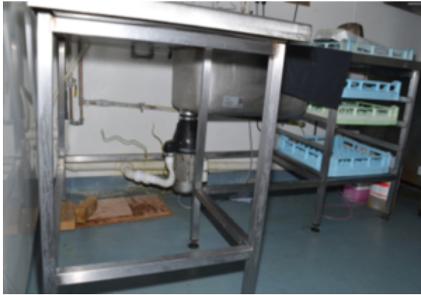
Bishops Wood Hospital kitchen area – sink and macerator underneath

The macerator was not protected by an earth wire and there was no residual current device (RCD) to prevent fatal exposure to the electrical current.