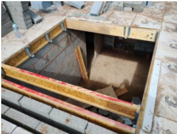
The collapsed stairwell after the incident

months into his career when the incident happened. An investigator for the Health and Safety Executive (HSE) said the teen was lucky to escape serious injury.