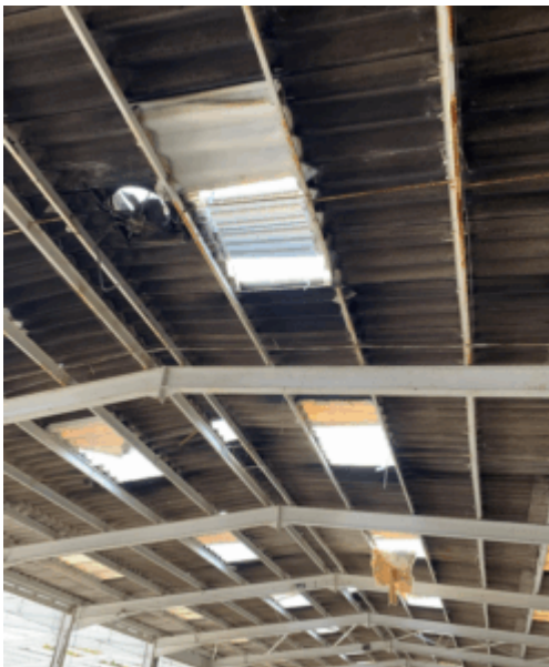
the worker fell from this roof

While helping to carry a sheet backwards near one of the holes, Mr Zdunczyk lost his footing. The weight of the sheet and his own bodyweight caused the unattached barriers to shift, exposing the edge of the opening and creating a gap. He fell approximately six metres to the concrete floor below.