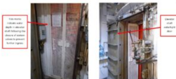
Figure 11 – Lift Entrance and Watertight Door in P-M-12

HSE issued Ithaca with an improvement notice and work in confined spaces was stopped by the company until February 2021 to allow a full review to take place.