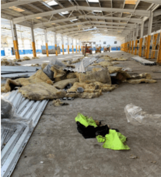
Warehouse in question

On 25 May 2023, 42-year-old Sylwester Zdunczyk was working with a team on the warehouse roof, removing aluminium over-sheeting. The sheets were being carried to pre-cut holes in the roof from where they were dropped to the ground floor. These holes were guarded by steel crowd control barriers secured together with plastic tie wraps – but they were not attached to the roof surface. No other fall prevention measures were in place.