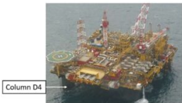
Figure 7 – Location of Column D4 on FPF-1

The workers had been descending in a lift located in one of the platform legs on the FPF-1 facility during a night shift on 10 December 2020 when the water started to flood into the lift before they reached the bottom of the shaft. The trio were knee-deep in water by the time the lift was able to be stopped by the workers via the emergency button.