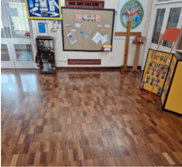
Holy Family Catholic Primary School in Bristol