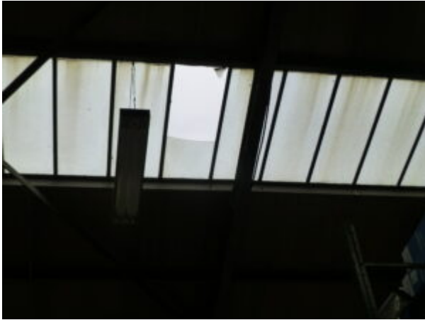
Adam Brunskill fell through an unprotected glass-wire skylight

Working at height remains one of the leading causes of workplace injury and death and HSE has detailed guidance on working safely at height .