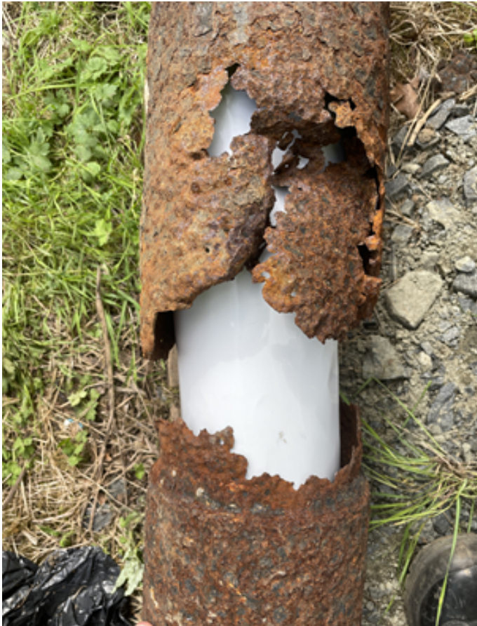
Image of the corroded lamppost following the collapse

Glasgow City Council, of City Chambers, George Square, Glasgow, G2 1DU, pleaded guilty to breaching Section 3(1) of the Health and Safety at Work etc. Act 1974. The Council was fined £80,000 at Glasgow Sheriff Court on 8 January 2026.