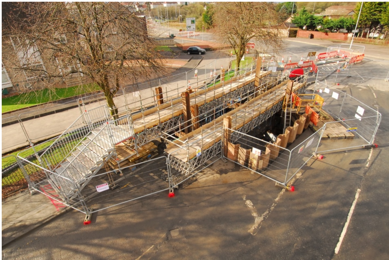
The Coal Authority's works at Kilbowie Road, Clydebank