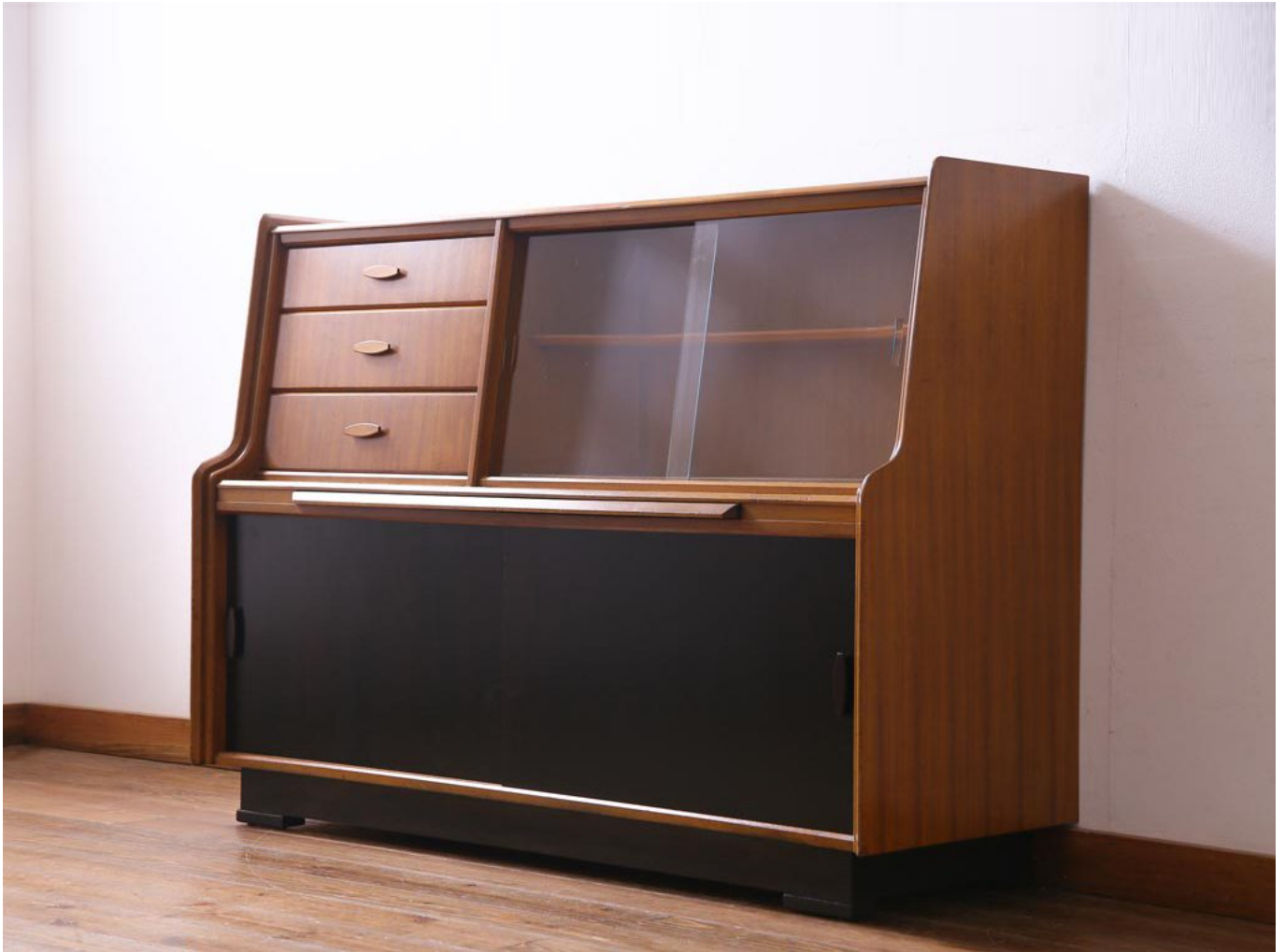
FD Welters Ltd sideboard as sold on www.rafuju.jp

The welters® name has been synonymous with quality furniture making for almost 100 years. Although primarily serving the British markets, over time innumerable items have found themselves exported abroad, either through commercial outlets or more commonly accompanying families emigrating to far flung lands and bringing their beloved possessions with them.