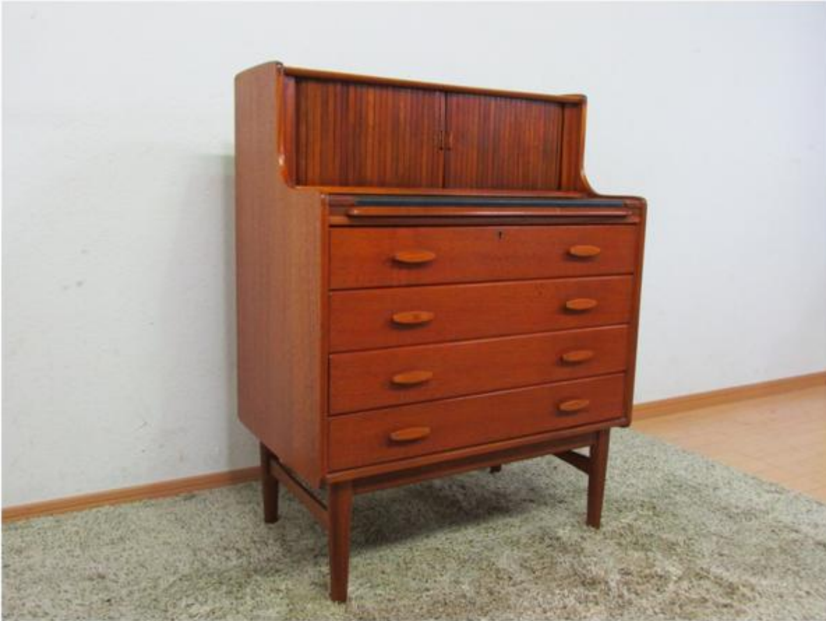
Writing bureau/cabinet as sold on www.buyee.jp

Other items have appeared for sale across Europe and in countries such as America and Australia, which really illustrates the longevity of the appeal in the company's legacy of classic furniture designs.