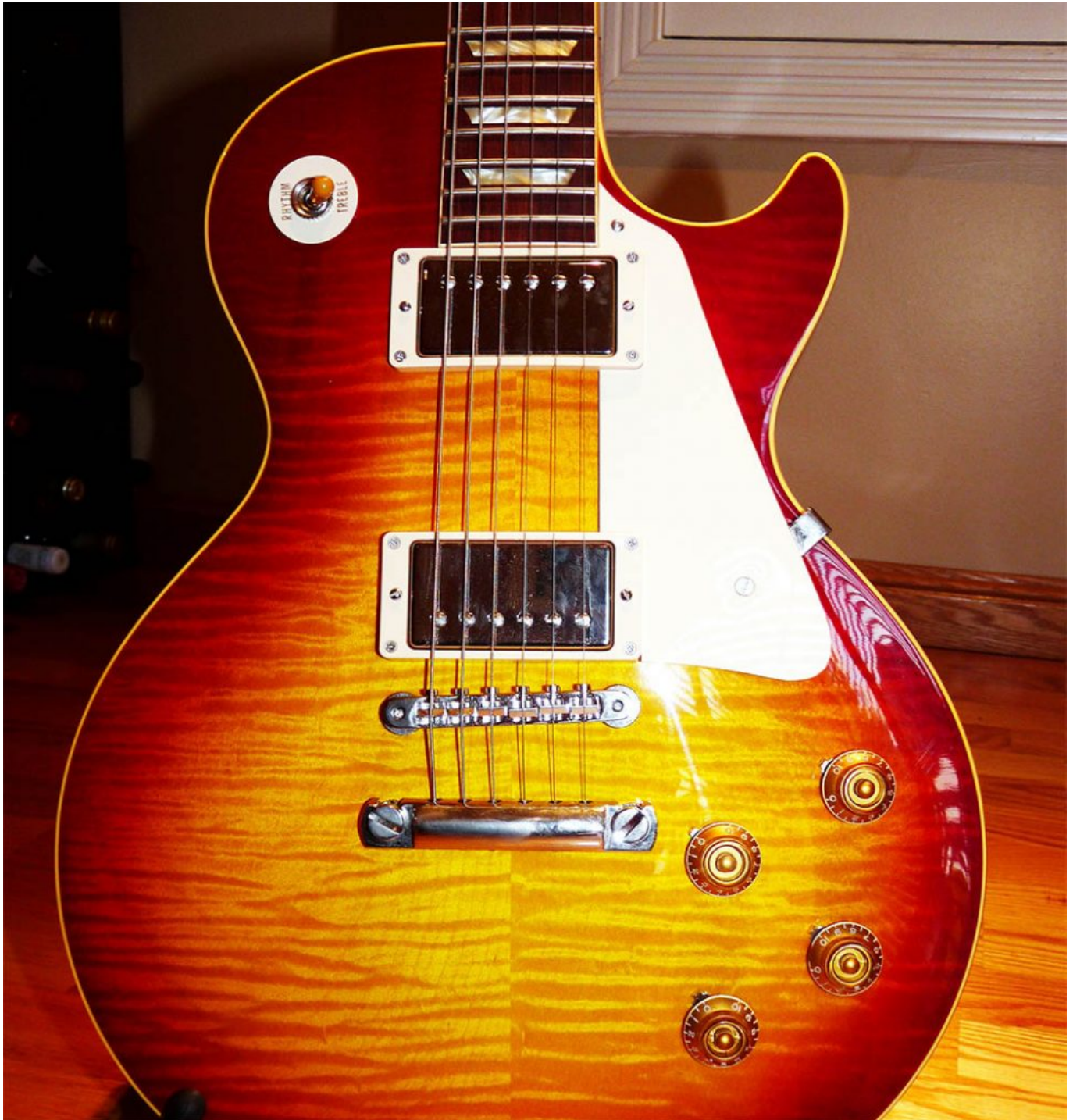
Gibson Custom 50th Anniversary 1959 Les Paul Standard (body)

The story of the Les Paul begins when Fender released the Telecaster, a guitar made from a solid body. Gibson saw this and decided they needed to gain some of the market share of solid body guitars. At this point, they approached the musician Les Paul to help them design some solid body electric guitars. Funnily enough, a few years prior to this, Les Paul had actually approached the company with the idea of building a solid body electric guitar and was in fact ridiculed by the company.