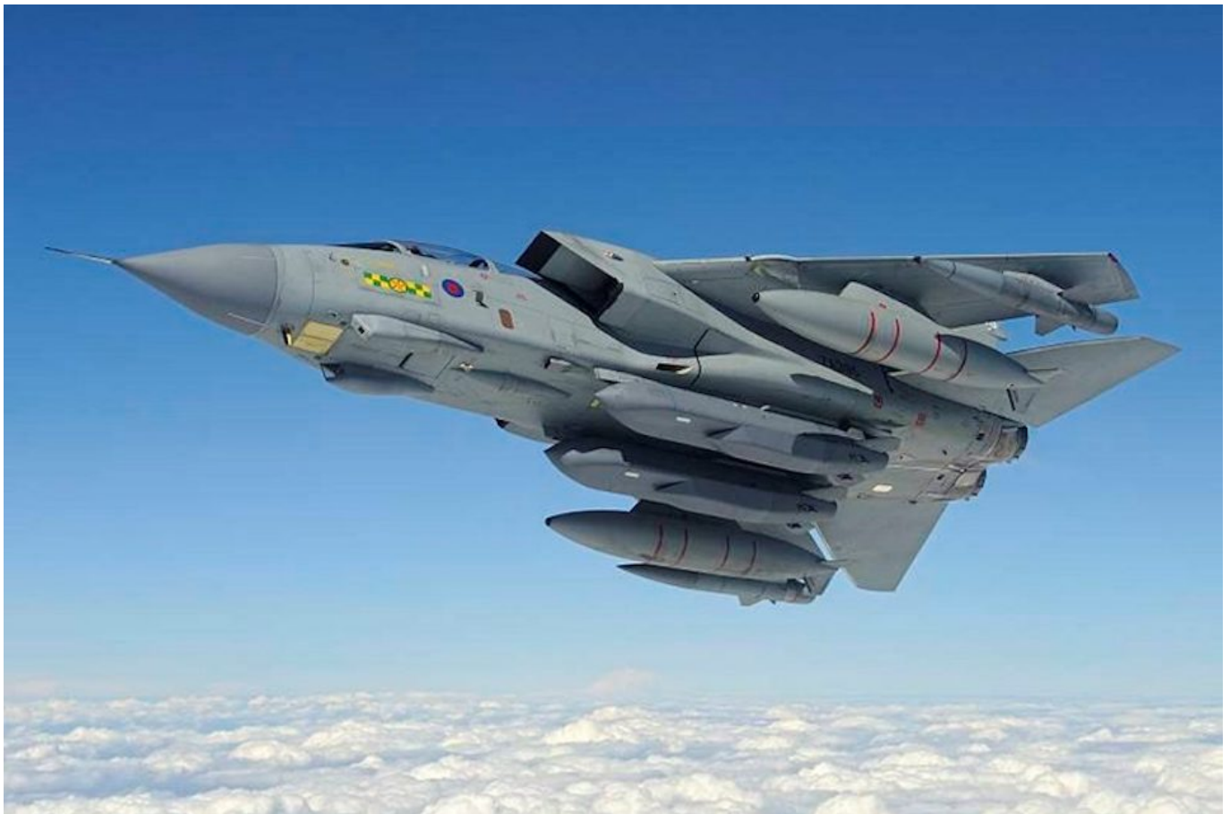
Two Storm Shadow missiles on a Tornado GR4.

The contract to regenerate Storm Shadow, a combat-proven, all-weather precision missile, provides a clear example of the MOD and UK industry working effectively together with our counter parts in France; providing our UK Armed Forces with the best equipment possible while sustaining dozens of UK jobs.