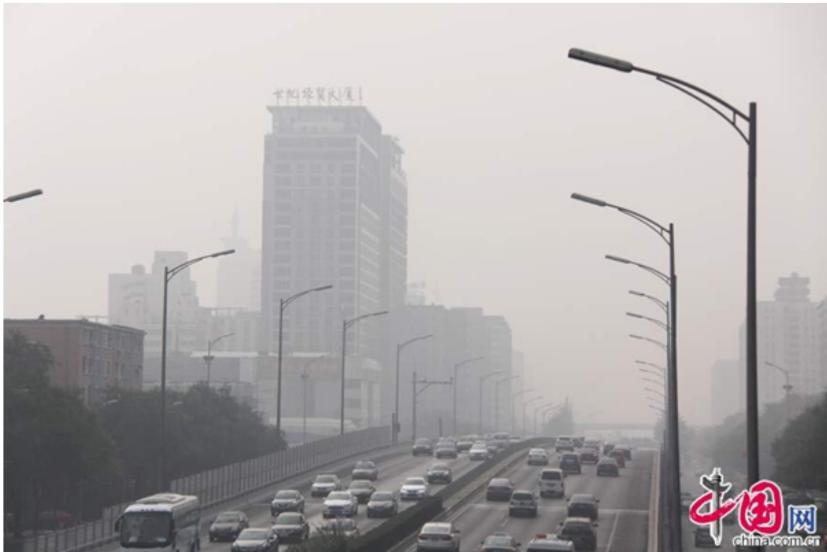
Heavy smog hits Beijing.

China will increase research on smog in its battle against air pollution in Beijing and surrounding areas.