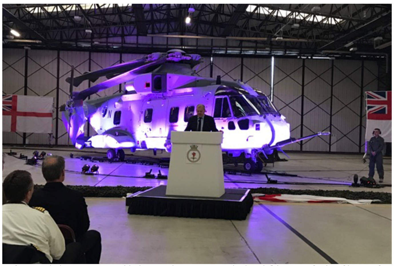
Defence Minister Guto Bebb has today announced the delivery of the first of a fleet of new helicopters designed for Royal Marine aircraft carrier operations.

homed here, this is another way defence is supporting the South West, where we spent over £5bn last year — more than any other region in the UK.