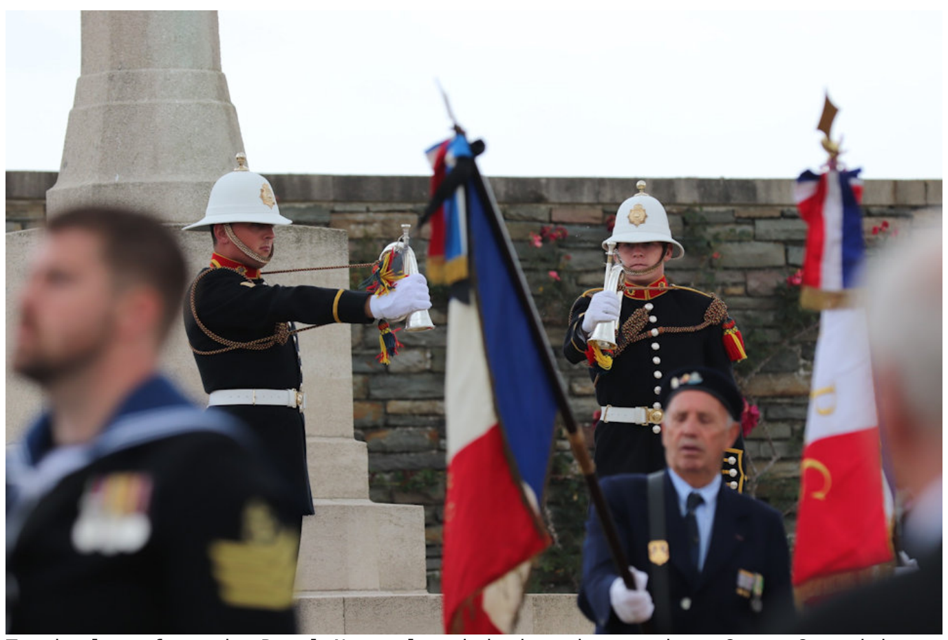
Two buglers from the Royal Navy played during the service