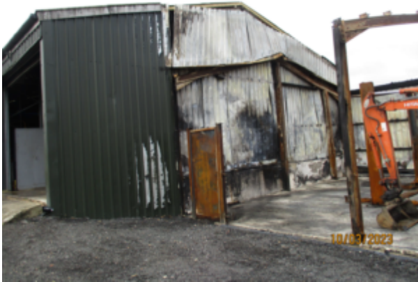
The barn which roof the man fell through

An investigation by the Health and Safety Executive (HSE) found that safety measures such as barriers, netting or access equipment were not in place.