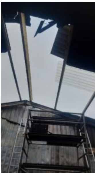
The man fell approximately 10 metres through the barn roof

Working at height remains one of the biggest causes of fatalities and major injuries. Common cases include falls from ladders and through fragile surfaces. HSE guidance is available.