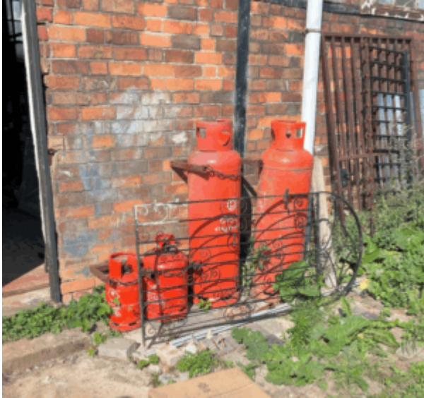
Unsafe storage of flammable gas

Despite this enforcement, follow-up inspections revealed continued non-compliance. HSE returned to the site five more times, serving three additional Improvement Notices and one Prohibition Notice.