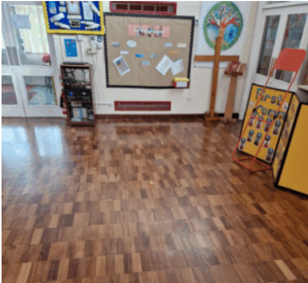
Holy Family Catholic Primary School in Bristol