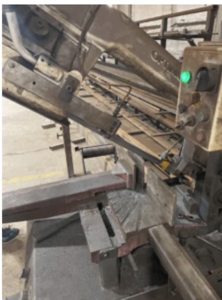
Buzzsaw without guard

Further material breaches were identified in a Notification of Contravention letter, including: