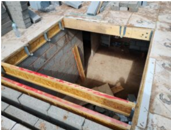
The collapsed stairwell after the incident

months into his career when the incident happened. An investigator for the Health and Safety Executive (HSE) said the teen was lucky to escape serious injury.