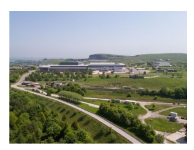
HSE's Buxton Science and Research Facility from the Air

"While Great Britain remains one of the safest places to work in the world, unfortunately workplace incidents have still occurred. We have continued to carry out forensic incident investigation, having ensured that our science and research facility in Buxton is COVID-secure."