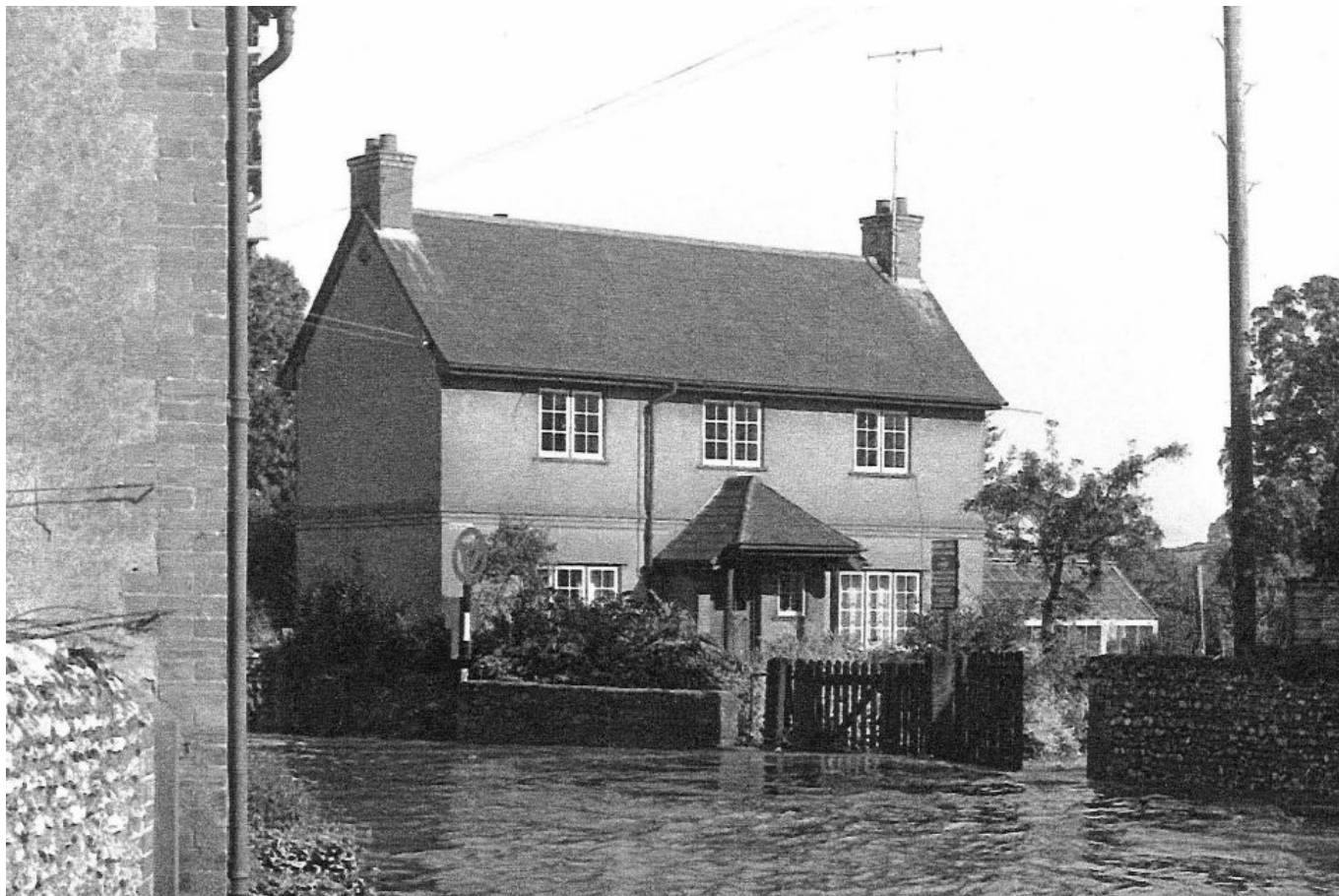
Frogmore Road, East Budleigh, July 1968