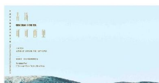
Blank First Day Cover