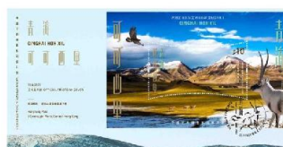
Serviced First Day Cover affixed with a $10 Stamp Sheetlet and date-stamped with associated special postmark.