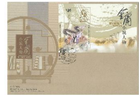
Serviced First Day Cover affixed with a stamp sheetlet and date-stamped with a special postmark.