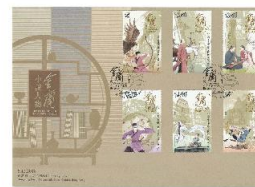
Serviced First Day Cover affixed with a set of 6 stamps and date-stamped with a special postmark.