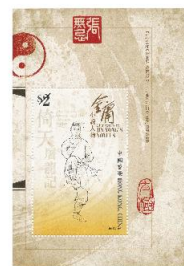
1 of 40 Stamp Sheets in Stamp Booklet