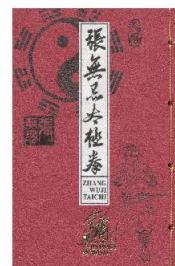
Stamp Booklet (Cover)