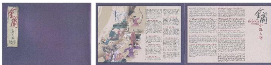
Presentation Pack (Cover)