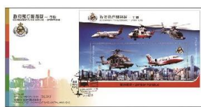
Serviced First Day Cover affixed with a Stamp Sheetlet.