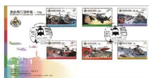
Serviced First Day Cover affixed with a set of 6 Stamps.