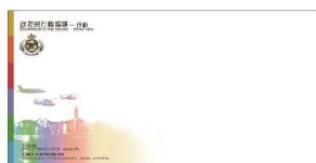
First Day Cover