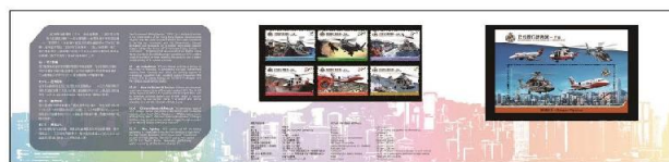
Presentation Pack (Inside).