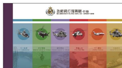
Prestige Stamp Booklet.