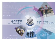
Presentation Pack (Cover)