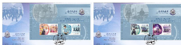
A set of 3 Serviced First Day Covers affixed with Stamp Sheetlets from Prestige Stamp Booklet