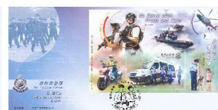
Serviced First Day Cover affixed with a Stamp Sheetlet