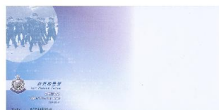
First Day Cover