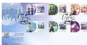
Serviced First Day Cover affixed with a Set of 6 Stamps