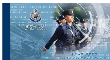
Prestige Stamp Booklet