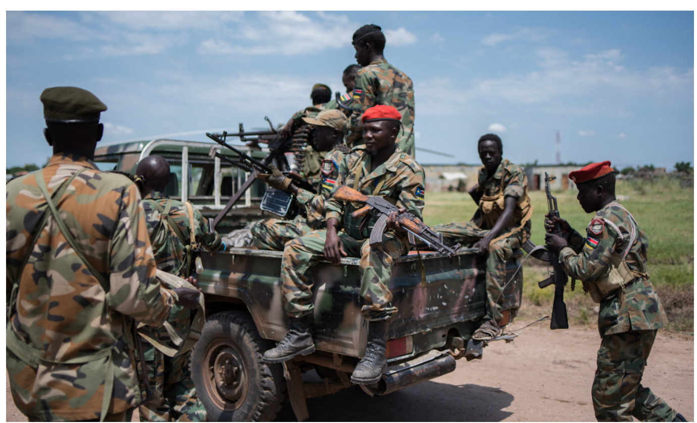
Main category: <a href="Middle-East">Middle-East</a>