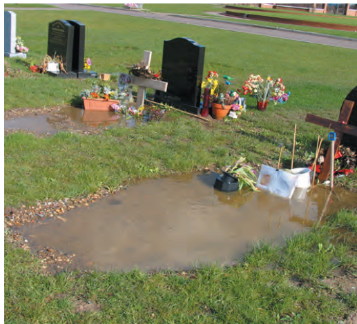
Example of tragic procedure

welters organisation worldwide has over many years developed Interment Systems for Burial and Commemoration throughout the welters Cemetery Village® programme which avoid pollution, adequately resolve land use issues whilst achieving absolute 'customer' focus which seems to be omitted from thought process and considerations by the majority of industry professionals.